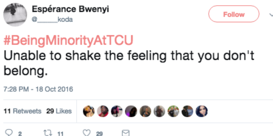
Figure 1. @____koda using the #BeingMinorityAtTCU to express the overall feeling of not belonging on TCU's campus.

In October of 2016, numerous tweets appeared on Twitter using the hashtag #BeingMinorityAtTCU. These tweets were mostly posted by students of color noting singular moments on the TCU campus that have shaped their experience. Most of the tweets represented microaggressions that students often faced, chronicling singular moments of this modern-day subtle form of racism (Minikel-Lacocque, 2012). Through this hashtag, with the exception of a few tweets, students explained moments in which they were discriminated against or negatively impacted because of their identity as a student of color. It is important to note that the experiences students expressed were not always overt forms of racism. Instead, many posts were about microaggressions—racist actions that, even though they may even come from well-intentioned peers, end up accumulating to make students of marginalized populations feel excluded and like they do not belong (Figure 1). #BeingMinorityAtTCU grew from a single tweet into an impromptu movement because many other students were experiencing the same situations. There was no specific organization behind the movement—it was a result of one student expressing an experience and many other students identifying with the hashtag. The resulting mass of tweets got the attention of TCU administration.