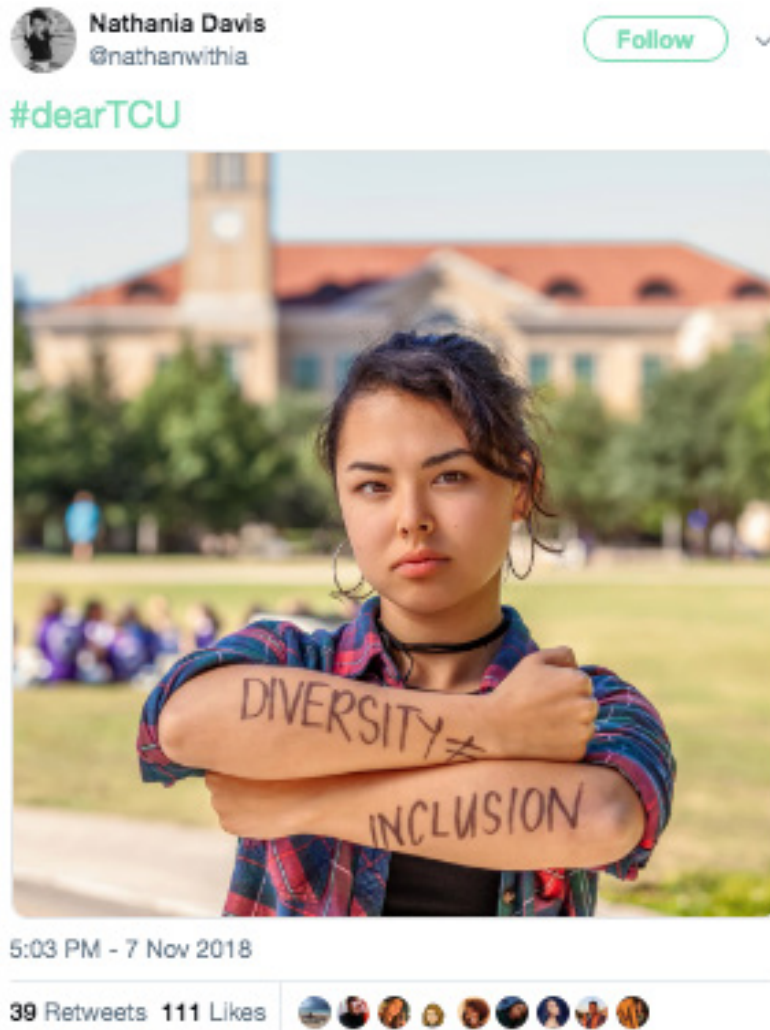
Figure 12. @nathanwithia using her #DearTCU picture as an opportunity to tell TCU that the increase in diversity does not always make it feel more inclusive for those diverse populations.

Through shedding light onto the student experience, specifically in the form of hashtag activism, TCU administration was able to see the realities of the experiences of many students who may have not been seen otherwise. This is evident in #DearTCU when TCU’s official Twitter account responded to every single tweet using the hashtag. All of these posts and images come together to provide evidence of ways students need to feel more supported by TCU—one of these ways being the addition of a DEI component into the core curriculum. Through engaging student voice through avenues that feel more comfortable to them, and meeting students in spaces where they are already organizing,