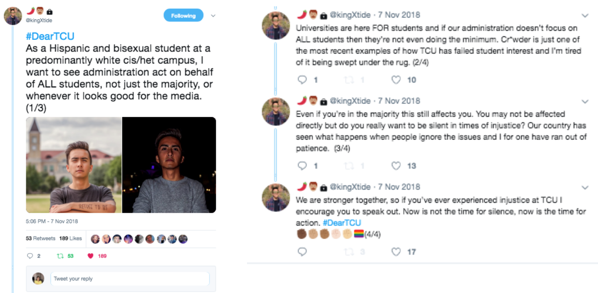
Figure 9. @kingXtide literally and figuratively refusing to be invisible by posting this as a form of protest against TCU administration.

Reflecting back on the “hidden curriculum,” Esposito wrote about the hyper-visibility of students of color (2016). This hyper-visibility is, interestingly, contradicted by a sense of invisibility that also exist among communities of color because of a lack of respect. This contradiction is why images were especially important in the #DearTCU movement; we wanted to be intentional about empowering students of color to feel visible by posting pictures of themselves as a form of protest, while also utilizing the identifying factors that often cause students to become excluded on college campuses. In Figure 9, the student makes a statement that he does not want to feel invisible on his own campus while displaying two parts of his identity as a bisexual Hispanic male. This use of imagery forces a visibility that is defined by the student posting the picture, as opposed as being defined by majority students.