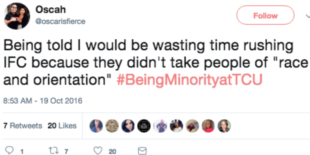
Figure 2. @oscarisfierce explaining a conversation, in which he is told not to go through Interfraternity Council recruitment because of his race and sexual orientation.