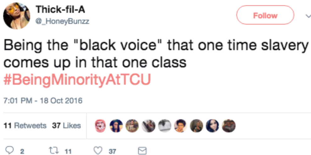
Figure 6. @_HoneyBunzz tweets about having to speak on behalf of her entire race when slavery comes up.

Figure 7 is similar to Figure 6, in the sense that many students of color are constantly asked to speak on behalf of their entire race. Even if a student is familiar with a specific topic in class, such as a country in Africa that their family may be from, they are still not able to speak on behalf of every single person who shares that identity or owns that same connection. It is more likely for students of color and students in marginalized populations to speak on behalf of a minority group because of the lack of understanding that exists in the majority population. Encouraging a more diverse curriculum, that covers content of diverse populations and skills on how to have inclusive conversations, can start to combat this issue.