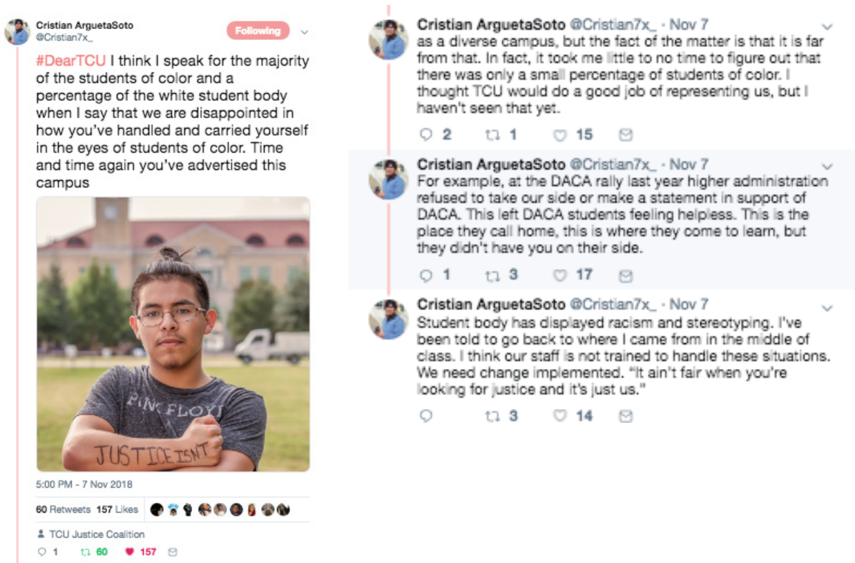
Figure 11. @Cristian7x_ calling out TCU administration and peers to ensure that the fight for justice isn't just individuals that are affected by injustice, but those that are part of the