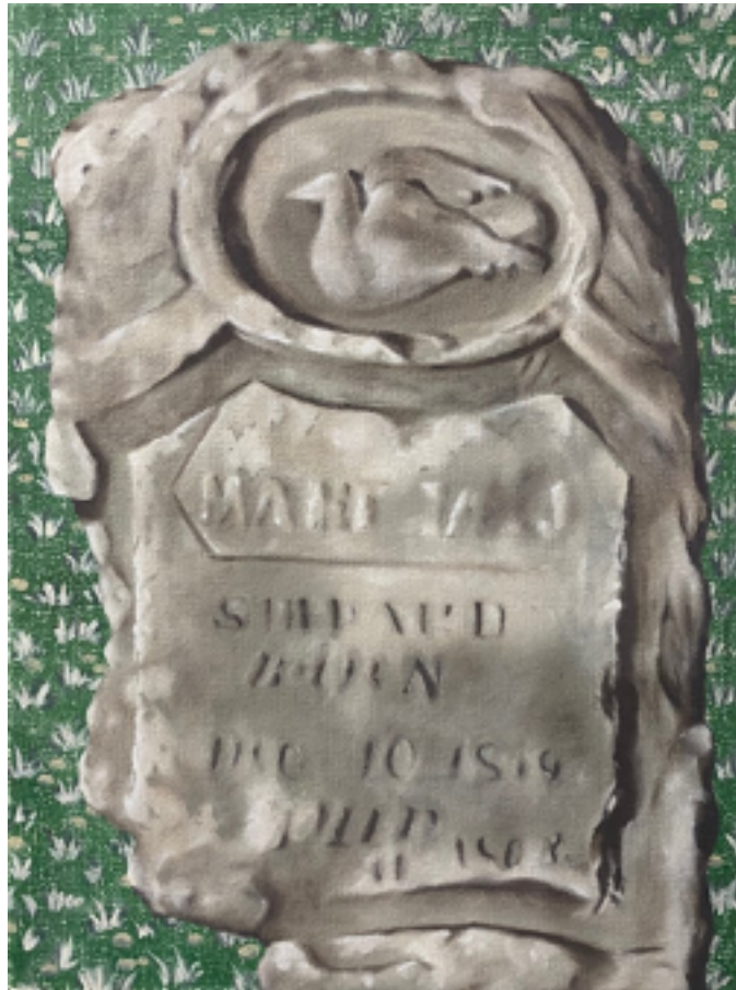
Tombstone Amongst the Grass (2020) 9 x 12 inches Oil on Canvas over Panel

in their beliefs. Perceptions of absolute truths and divine encounters continue to sculpt human history. However elaborate our imaginations may be, nobody can definitively foresee what happens after death, for logic cannot faithfully predict a terrain the brain cannot survey. In the first painting for my thesis project, a self-portrait, Self (2019), I imagined how I could exist after dying. Theistically, perhaps my soul persists in some eternal, conscious form. The golden transparency of the second figure emerges from a Protestant Christian upbringing, illustrating the distinction between the non-material eternal spirit from the material body. Atheistically, I position a pale shadow behind the second figure, implying that the mind and body are inseparable and transient. In this manner, after death, we only exist in the memories of others; even here, our shadow is temporary. Self (2019) forced me to consider my own mortality and imagine the retention of consciousness, or the complete lack thereof into the afterlife.