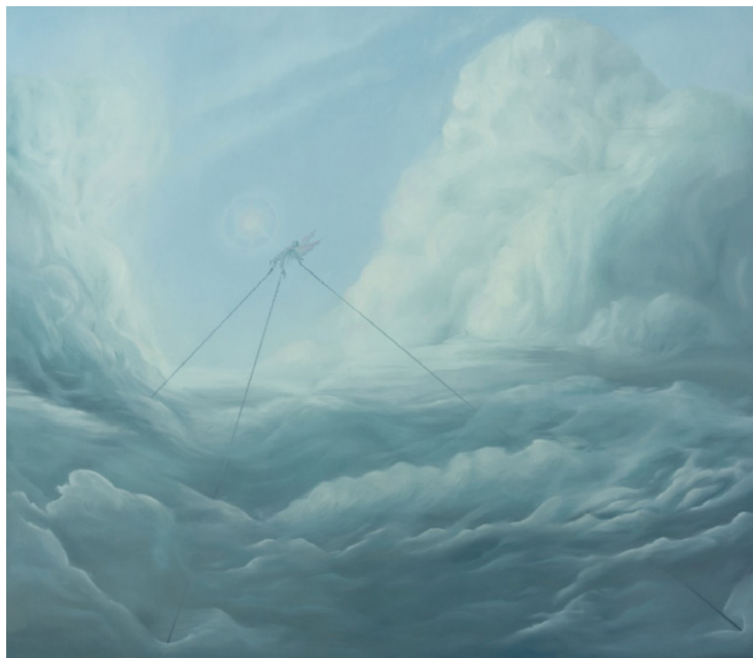
Our Chains Encode Us (2019) 26 x 40 inches Oil on Canvas over Panel

I explored the notion that through immortality, we may overtake thanatophobia in Our Chains Encode Us (2019), which superimposes the Caduceus onto the myth of Icarus to illustrate the rise of modern medicine. Although I respected common iconography by using the Caduceus to represent medicine, here I will discuss the Greek myth of the demigod Asclepius. His father Apollo grants him gifts of healing and