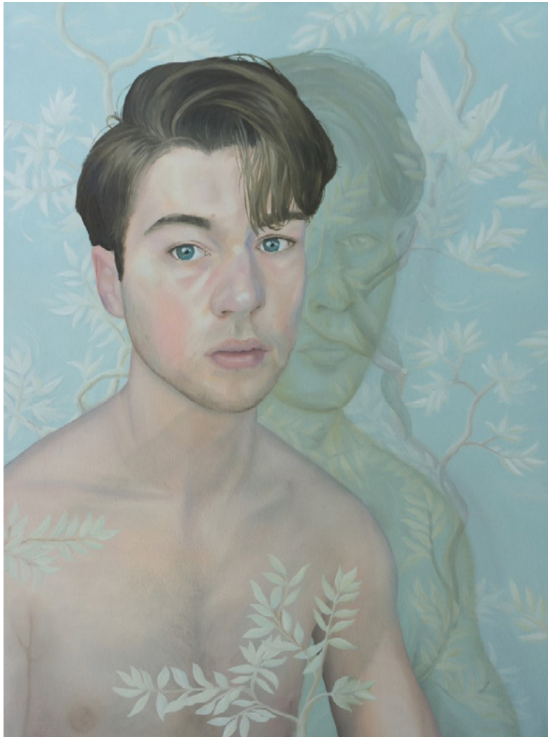
Self (2019) 6 x 20 inches Oil on Canvas over Panel

Science contributes to the span and quality of human life by seeking to explain the mechanisms behind health and illness. Medicine bridges the applications of science and faith when culturally competent healthcare professionals strive to curate treatment plans that respect their patients' beliefs. However, contemporary science cannot yet overcome the reality that all beings are mortal. As powerful as medicine can be, research increasingly reveals an unanticipated complexity of the biological system, including natural limits to longevity. Humans are eukaryotic organisms, a domain of life which encodes genetic information on linear DNA chromosomes. Cells naturally die over time but replenish themselves via mitosis, during which the cell duplicates the genome and divides into two daughter cells. During each round of division, the chromosomes shorten as a consequence of how linear DNA replicates. Normally, this is not an issue because the fractions lost contain only repeated sequences called telomeres, which do not encode for proteins. However, as we age, many repeated rounds of cellular division shorten the telomeres to the point that they cannot protect vital genetic information deeper within the chromosomes. At this point, cells stop dividing, and the body cannot repair itself following damage or infection. Eventually, the effects of aging become apparent.