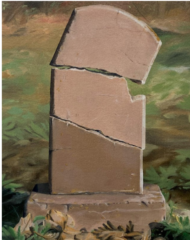
Tombstone Amongst the Leaves (2020) 8 x 10 inches Oil on Canvas over Panel