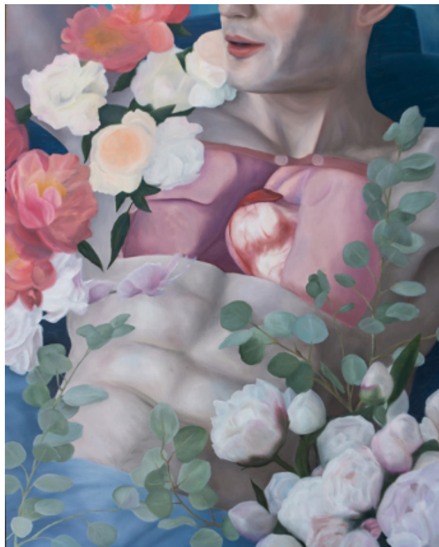
Remembrance (2019) 24 x 30 inches Oil on canvas over panel

This off campus site visit was part of an open-ended painting assignment titled “The Body.” I painted Remembrance (2019), in which a man lays amongst peony flowers and silver-dollar eucalyptus leaves, his chest surgically opened to reveal his heart and lungs. I wanted the piece to convey the sense of awe and respect that I felt in the cadaver lab, so I painted realistically, using online three-dimensional anatomical models to capture the crude details and subtle beauty of body donation. The painting is twenty-four by thirty inches, which presents the figure as slightly larger than life to highlight the human body. Spending time amongst the dead or painting organs for hours on end brought my attention to how I would leave my