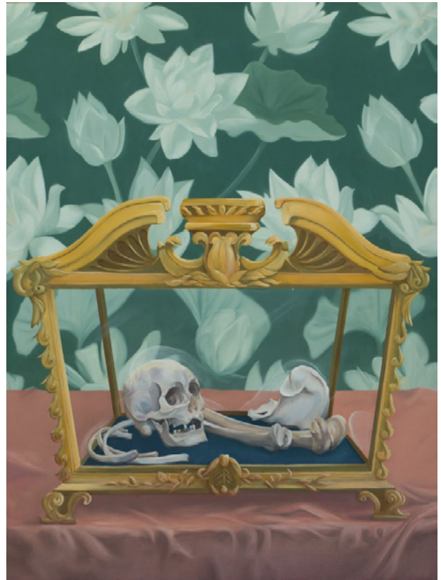
How Will You Be Preserved? (2019) Diptych; Each panel 32 x 42 inches Oil on Canvas over Panel

Historically, artists have used skulls to communicate mortality. Along with other Dutch masterpieces, Still Life with a Skull and a Writing Quill (1628) by painter Pieter Claesz uses realistic detail and an illusion of close proximity to force viewers to consider the transience of life. 6 Even earlier, in the medieval period, monks would often place human skulls in their cells to help them remember their own mortality, meditate, and live intentionally. 7 The experiential and emotional dimension of religion describes the feelings aroused by participation in spiritual traditions. 8 These feelings may include relief or comfort in the promise of life after death. Religions vary greatly in ritual, but different beliefs of an afterlife all similarly depend on some realization that our biological life is temporary. While some medical scientists study skeletons to prolong our lifespans, religious institutions celebrate bones as a means to remind their followers that spirituality supersedes mortality. Anne Schuchman writes of Umiliana De Cerchi, a widow who dedicated her life to the Roman Catholic church in the thirteenth century. 9