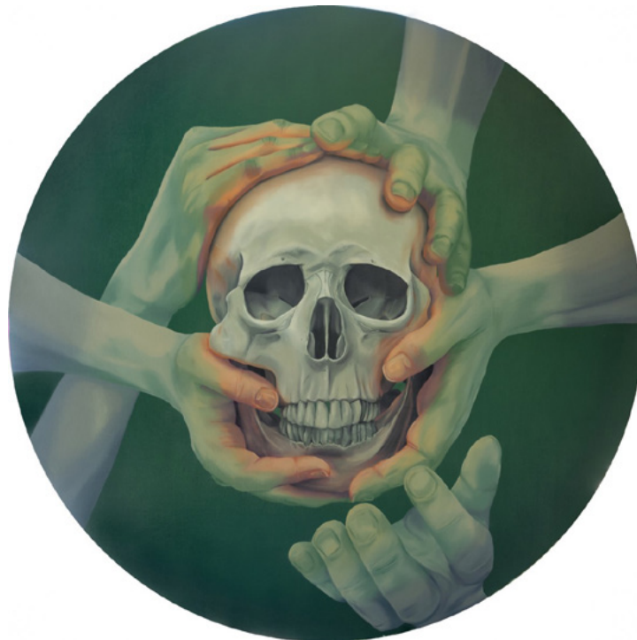
There is Fellowship in Dying (2020)

My hope for this project is to communicate not only that we all, in some degree, are fearful of mortality, but especially that it is important to recognize our own death anxiety. Since death is a universal human experience, it is equally important to question why conversations about death so rare among healthy people. What influence do discussions about death with members of your inner circle on your ability to live freely and connect with others? In my painting There is Fellowship in Death (2020), I illustrate the positive energy associated with death-focused conversations. By reaching from the cooler edges of the composition, the figures warm as they approach the central skull, a literal interpretation of death. As fingers and palms contact the skull, they illuminate a brighter positive warmth. Indicative of heat-mapping, I wanted this painting to illustrate the life we feel in community, as opposed to the cold darkness of isolation.