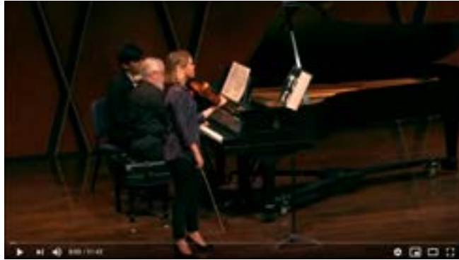
Amy Beach Violin Sonata